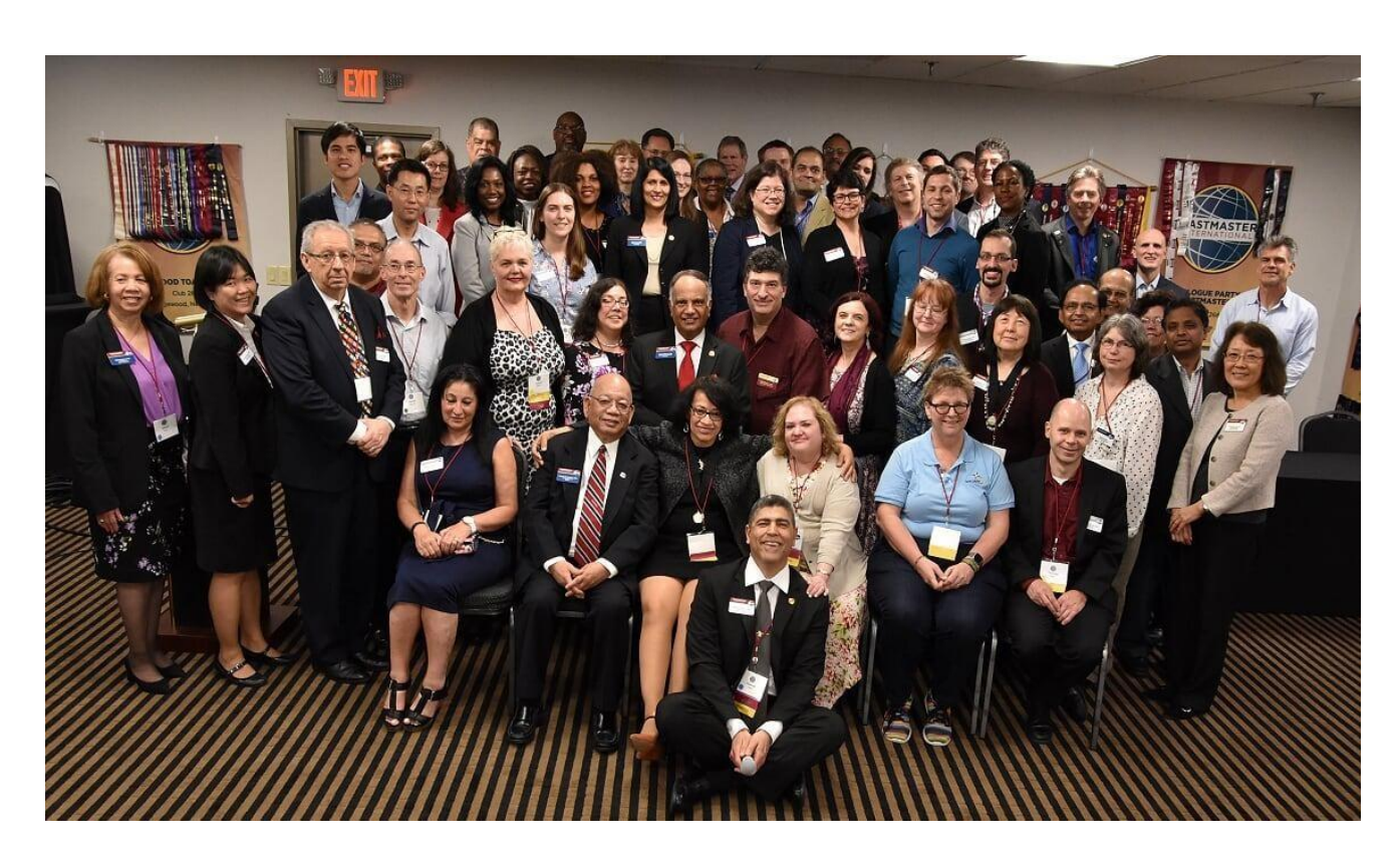
Conference attendees pose for a photo after dinner.